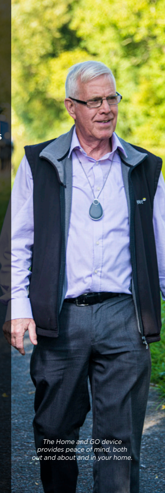
The Home and GO device provides peace of mind, both out and about and in your home.